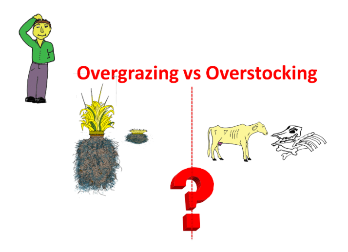
Figure 1: Difference between overgrazing and overstocking

The condition and productivity of your rangeland is the foundation on which a productive and viable livestock production enterprise in Namibia should be built. Two of the most important elements of rangeland production and restoration are OVERGRAZING and OVERSTOCKING. These two elements of rangeland management are extremely important but are very often confused with each other.